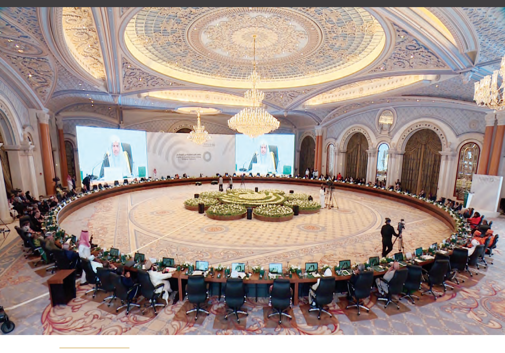
The participants called for relevant national and international institutions to exert their best efforts to safeguard freedoms within the framework of relevant international and domestic laws.

global forum themed: "Religious Diplomacy Forum for Building Bridges"; based on the influential role of religions in human societies and the important role of followers of religions in bridging the relationships between different religions and cultures. They also announced a plan to issue an international encyclopedia themed: "The Encyclopedia of Common Human Values". The secretariat-general of the forum is entrusted with making the necessary arrangements to carry out the task, including selecting the writers and having the document evaluated by religious scholars, academic personali-