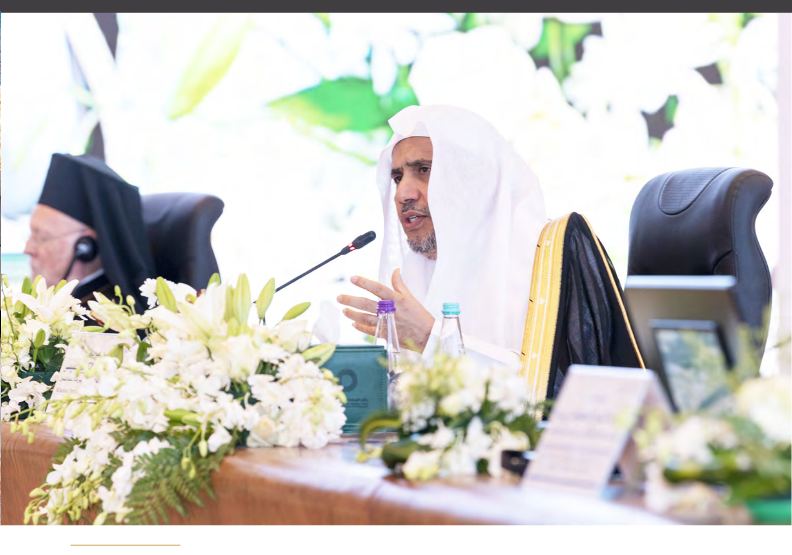
Dr. Al-Issa: "The unity of origin and the [unique] human sentiments and requirements have formed common values among all."

The participants invited the United Nations' General Assembly to establish a world day for "Common Human Values" as it would lay the foundation of common ground for achieving human fraternity.