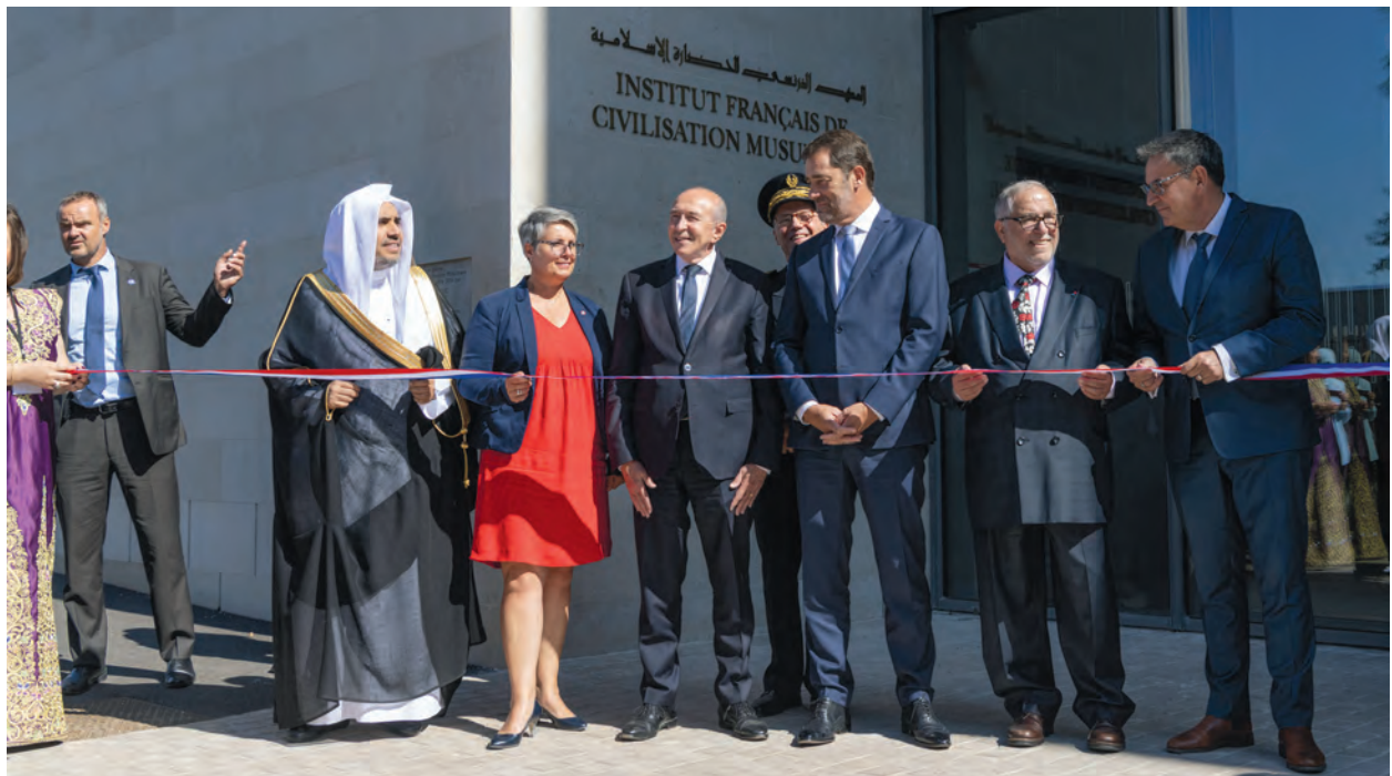
His Excellency cuts the ribbon to inaugurate a future of promise at the French Institute of Islamic Civilization.

Editorial Staff of the Journal of the Muslim World League | September 2019