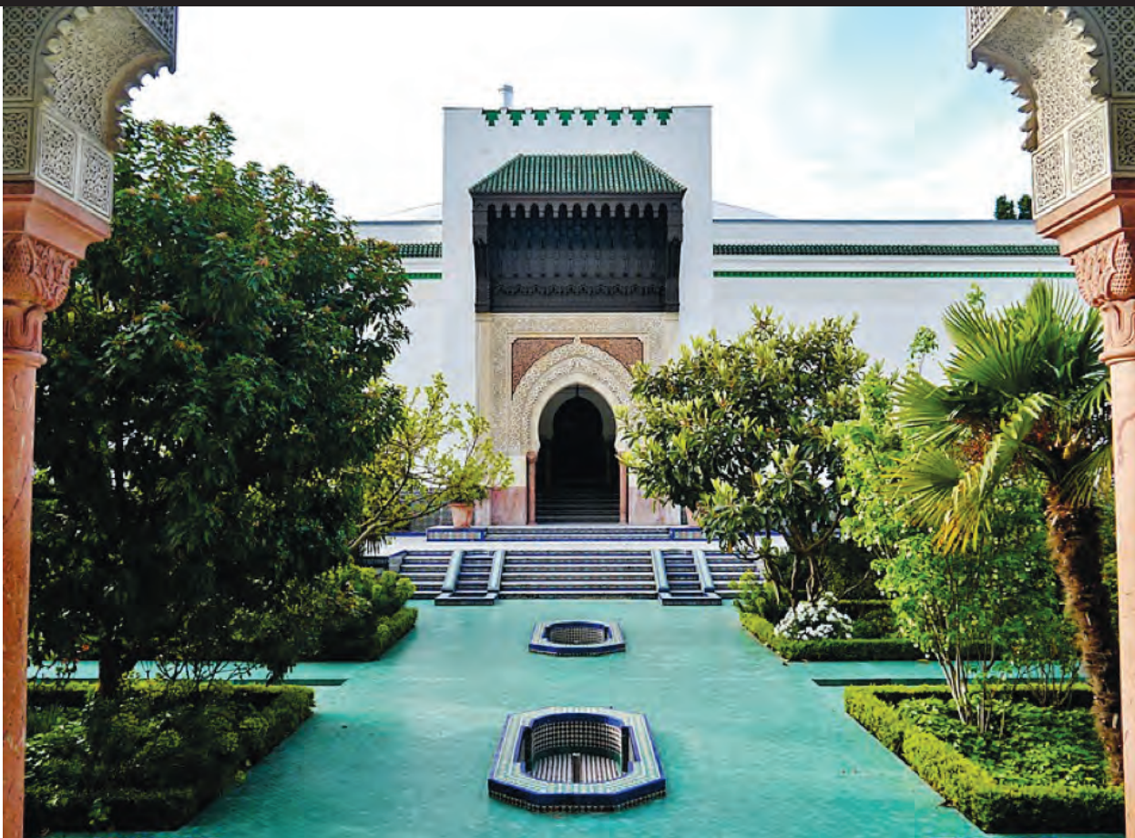
Garden of the Great Mosque of Paris.

thousand of the Moriscos were welcomed into France, which offered to facilitate passage to Islamic lands for those who wished to be in the lands of their ancestors.