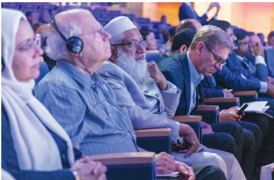
Audience listening to speakers discuss the importance of interfaith dialogue and cooperation.

H.E. Sheikh Dr. Al-Issa was awarded a medal from the Collège des Bernardins in Paris for his efforts in promoting peace and solidarity among world religions. The Collège des Bernardins is one of the oldest Catholic universities in France.