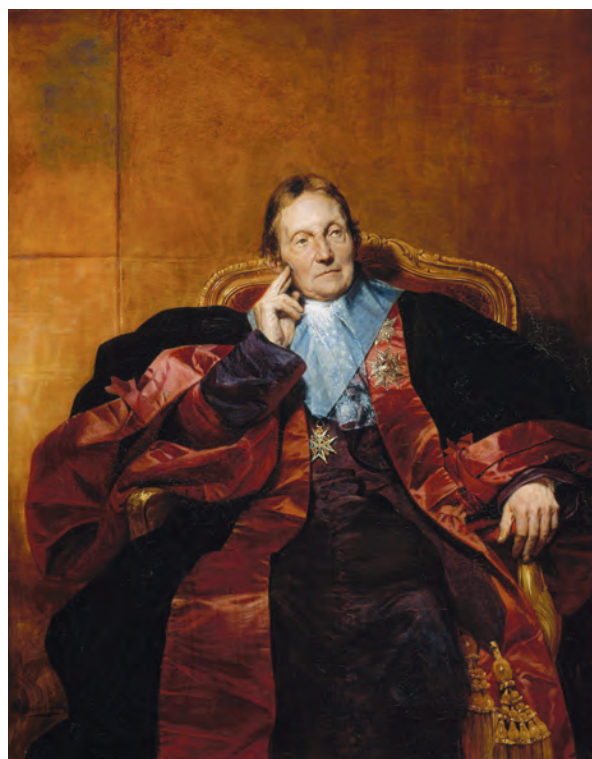
The Marquis de Pastoret

Jean-Jacques Rousseau (1712-1778) was yet another Enlightenment-era French philosopher who commented on Islam in his magnum opus, The Social Contract (1762). The Prophet he said was a great legislator who successfully combined spiritual and worldly power. In 1787, Claude-Emmanuel Pastoret (1755-c. 1830), a French author and politician, published his Zoroaster, Confucius and Mohammad , in which he compared and contrasted the careers of the three Eastern religious “great men,” “the greatest legislators of the universe.” He defended Islam against the attacks commonly made upon it and praised the Qur’an for the manner in which it professes the unity of God. ❖