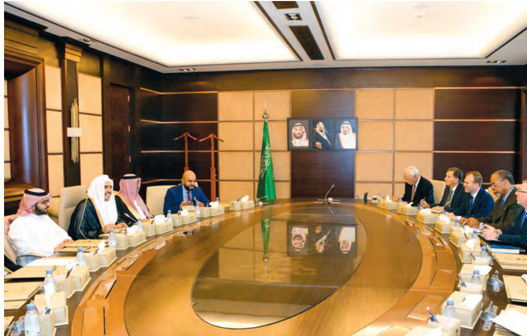
Meeting with the delegation of the U.S. evangelical community.