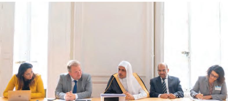
H.E. Dr. Al-Issa with members of the Saudi-French Committee, September 2019.

Ties with France have been growing ever stronger for the home country of the Muslim World League, and perhaps here a quick summary is in order: An official visit in May 2015 by French president Francois Hollande was particularly historic as he met Custodian of the Two Holy Mosques His Majesty HRH King Salman bin Abdulaziz Al Saud and he was the guest of honor at the Gulf Cooperation Council summit. In March 2015 HRH Crown Prince Mohamed bin Nayef, then Deputy Premier and Interior Minister, visited France, where he received the Legion d' Honneur (the highest honor in France, whose recipients are designated by the French president). On 6 March 2016, a joint communiqué was signed between Saudi Arabia and France, and then on May 2016, a delegation of the Saudi French Parliamentary Friendship Committee of the Shura Council (in Riyadh) had a meeting with French Foreign Ministry. And just a few years prior, a committee was established for Saudi-French expanding trade known as the "Saudi French Business Opportunities Forum." As reported to Al Arabiya these contracts, highlighting growing ties between Paris and Riyadh, are "the first signs of a much stronger Saudi-French alliance, and the next few months are going to demonstrate exactly just how close these two allies have now become." Thankfully, Dr. Al-Issa is able to cultivate these ties further with his sustained dialogue of civilized values between the two countries and long-term friends.