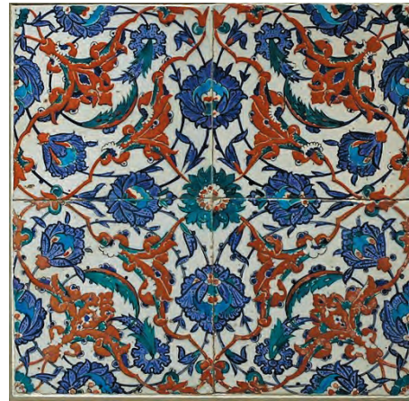
An Islamic tile at the Louvre

In 1932, the Department of Asian Arts was created and housed the Islamic collections. After