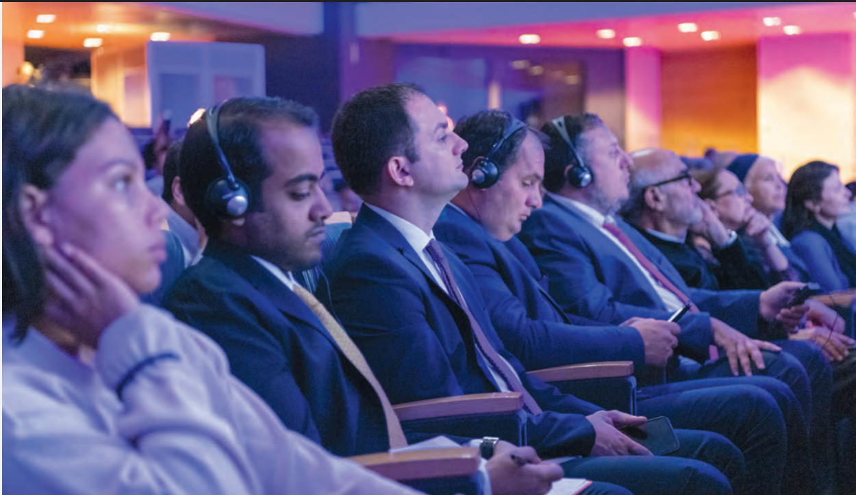
Listeners watching on as faith leaders speak on the commonalities that bind together humans.