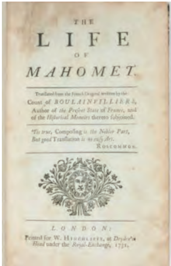
An English-language translation of Henri de Boulainvilliers's classic La Vie de Mahomed , 1731.

Editorial Staff of the Journal of the Muslim World League | September 2019