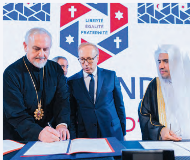
H.E. Dr. Al-Issa signing the MoU for the Abrahamic Family alongside French Catholic, Orthodox and Protestant religious groups.

MWL, underscored the need to protect religion from political exploitation, and the need to safeguard young people of all religions from the menace of extremist outfits.