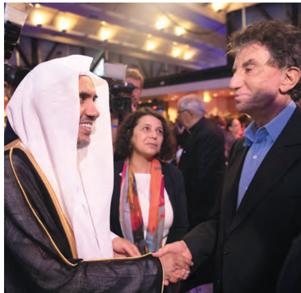
Jack Lang, noted French politician and defender of Islam with H.E. Dr. Al-Issa.

— Jack Lang, former French cultural minister and current President of the Institute du Monde Arabe, in Le Figaro , January 2015