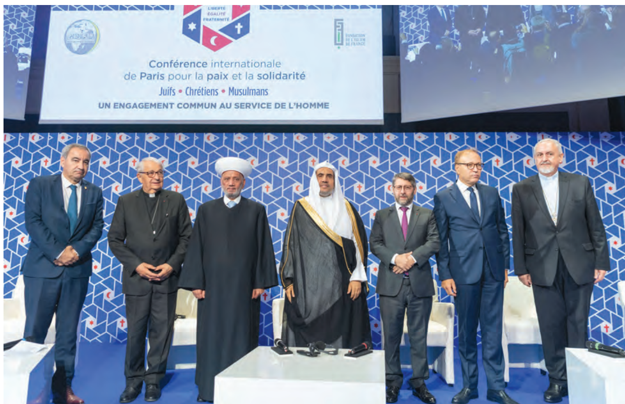
H.E. Dr. Al-Issa with his fellow dignitaries at the conclusion of the signing of the historic Paris Memorandum of the Abrahamic Faith.

– The Grand Mufti of Lebanon, Abdellatif Deriane, Paris, September 17, 2019