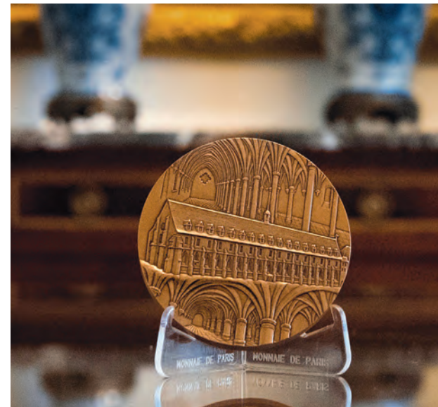
The Collège of Bernardins, one of the oldest Catholic universities in France, awarded this medal to H.E. Dr. Al-Issa for his work promoting peace and solidarity among the world’s religions.