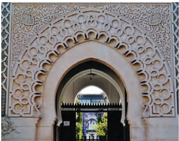
Front entrance of the stunning La Grande Mosque of Paris, completed in 1926 in honor of Muslim soldiers from colonial territories who served the French Army.

Editorial Staff of the Journal of the Muslim World League | September 2019