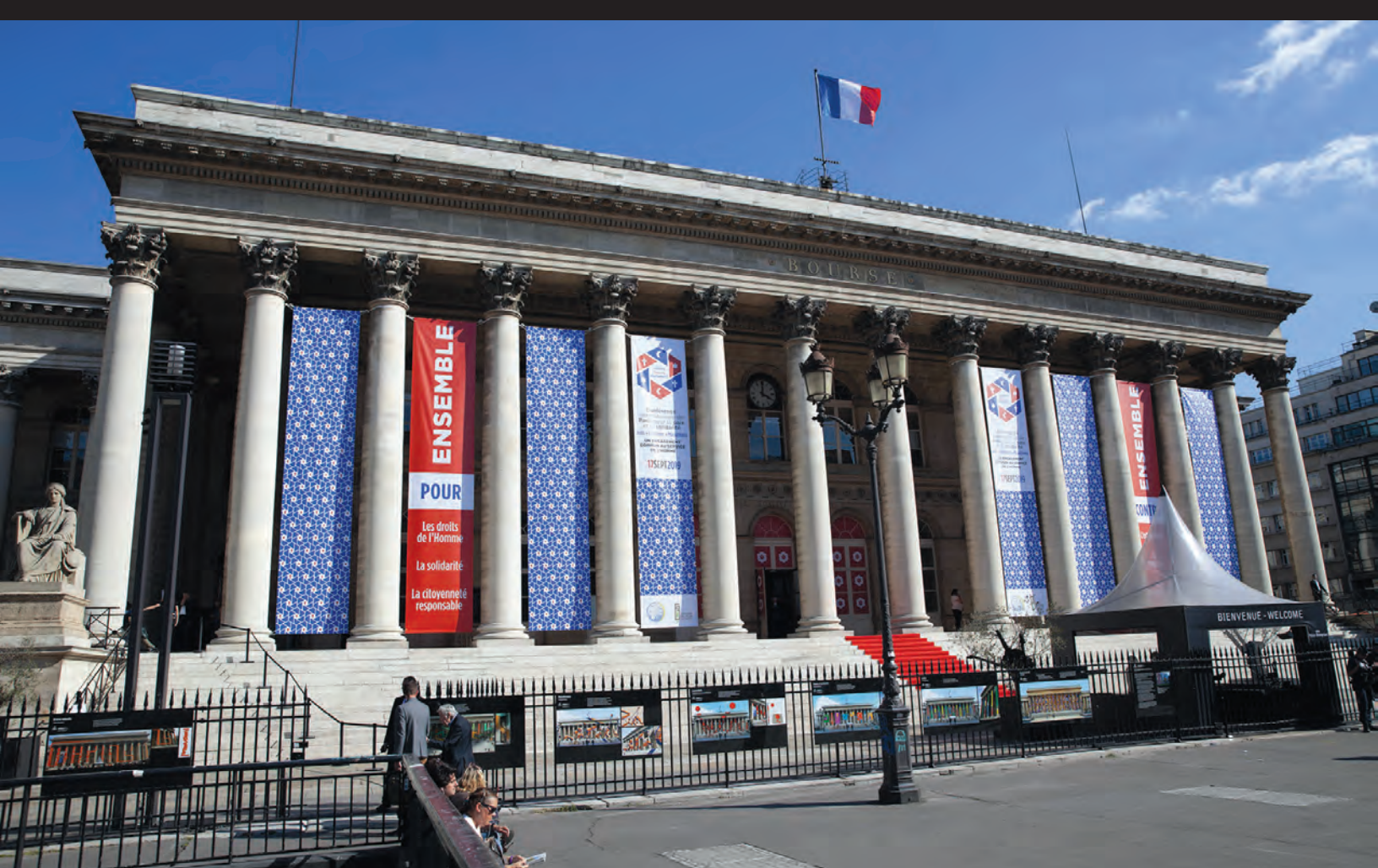
A grand entrance for a grand event. The facade of the former Stock Exchange

attendance by religious leaders and scholars— became the first Islamic sponsored event to bring together followers of the Biblical religions under a single cooperation document. Under the historic agreement, the parties will work to promote peace and harmony in the face of extremism, hatred and racism and the