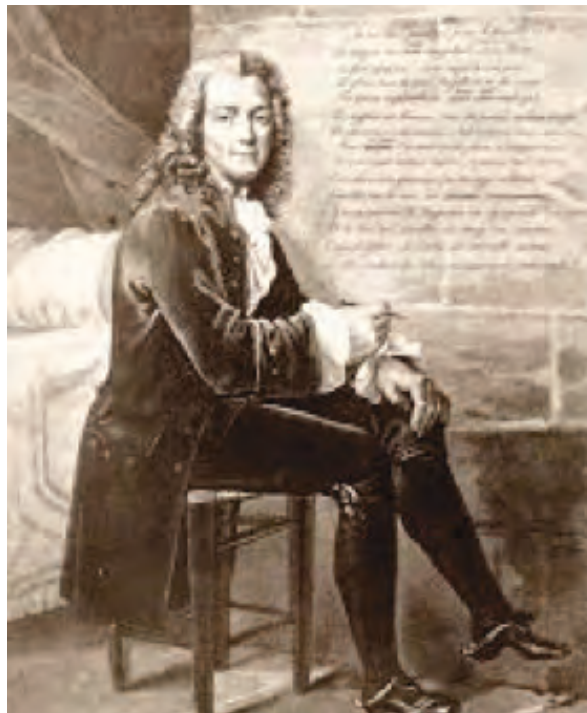
Le grand philosophe Voltaire

Henri de Boulainvilliers (1658-1722) was a French nobleman and historian, inspired by the famous philosophers René Descartes and John Locke, and an Enlightenment-era intellectual who wrote on physics, philosophy, theology and, of course, on history. In one of his more famous works, titled Vie de Mahomed ("Life of Mohammad"), he defended