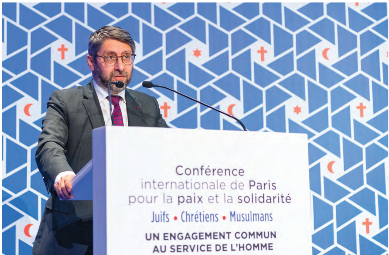
Rabbi Haim Korsia speaking on the harmony and peace that exist within all faith, religions and creeds.

🗨️ Religious and cultural diversity never justifies conflict. Humanity needs positive, civilized partnerships and effective interaction. diversity never justifies conflict. Humanity needs positive, civilized partnerships and effective interaction.