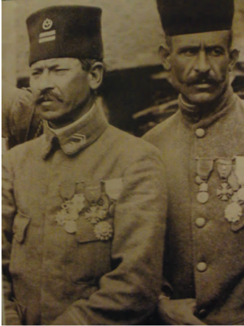
A Muslim lieutenant and Muslim tirailleur from a Tunisian regiment that served the 4th RTA of the French Army during World War I. Both men are highly decorated, their honors including the Legion d'honneur, Medaille militaire, and the Croix de Guerre with palm. Photo dated 1917.