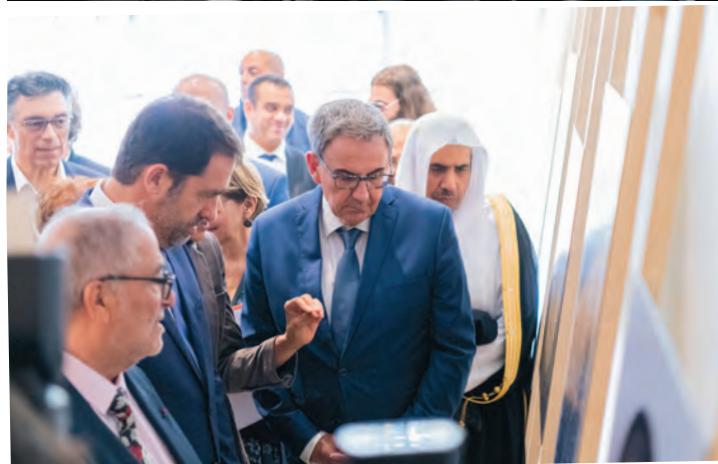
Inauguration of the French Institute of Islamic Civilization.