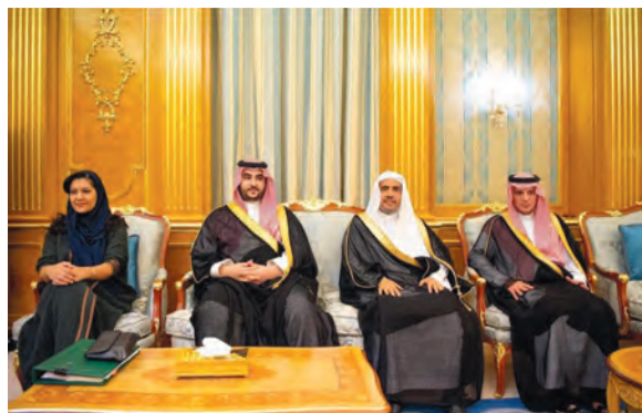
Key representatives of the U.S. evangelical community met senior Saudi H.E. Dr. Al-Issa in Jeddah

communities and nations, and that it is entrusted to nurture "the future of new generations to emerge on the values of moderation, love and respect for others."