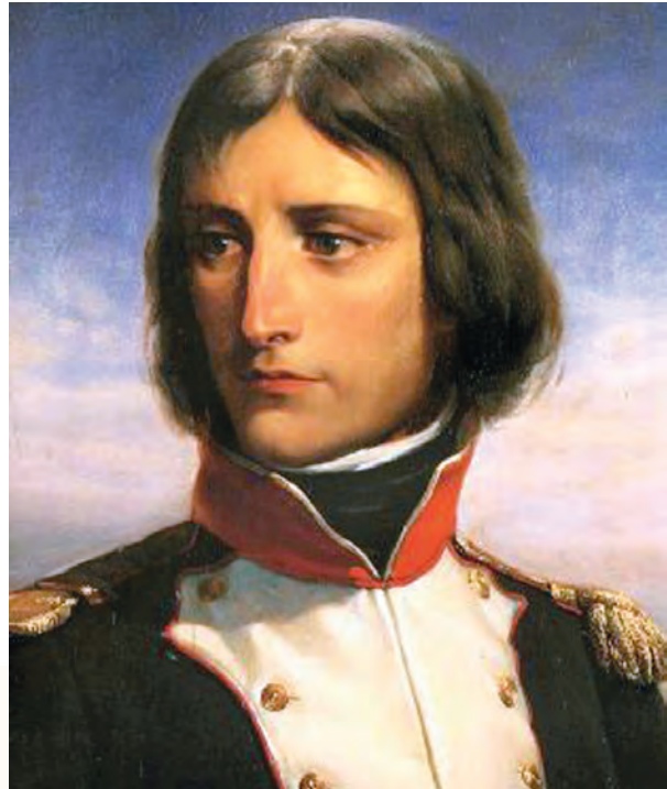
The young Napoleon.

“He addressed savage, poor peoples, who lacked everything and were very ignorant; had he spoken to their spirit, they would not have listened to him. In the midst of abundance in Greece, the spiritual pleasures of contemplation were a necessity; but in the midst of the deserts, where the Arab ceaselessly sighed for a spring of water, for the shade of a palm where he could take refuge from the rays of the burning tropical sun, it was necessary to promise to the chosen, as a reward, inexhaustible rivers of milk, sweet-smelling woods where they could relax in eternal shade, in the arms of divine hūrīs with white skin and black eyes. The Bedouins were impassioned by the promise of such an enchanting abode; they exposed themselves to every danger to reach it; they became heroes. Mohammad was a prince; he rallied his compatriots around him. In a few years, his Muslims conquered half the world. They plucked more souls from the false gods, knocked down more idols, razed more pagan temples in fifteen years, than the followers of Moses and Jesus Christ did in fifteen centuries. Mohammad was a great man.”