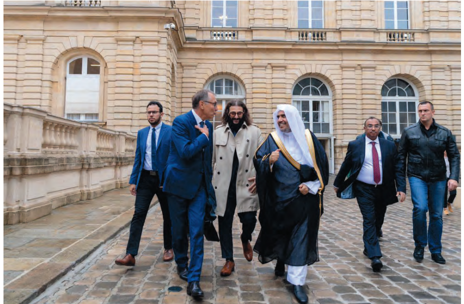
H.E. Dr. Al-Issa sets out from the Luxemburg Palace with Chairman of the Saudi-Arab Parliamentary Friendship Committee.

This day marks the “International Day of Charity,” a celebration of particular importance for the MWL. Charitable projects are the mainstay of the ethos of the MWL and its affiliate, Islamic Organization for Relief, Welfare and Development, and the personal passion of H.E. Sheikh Dr. Al-Issa, in accordance with Islamic principles. Recent activities in this arena include relief for orphans in Jordan, Pakistan, Ghana and throughout the African continent; $5 million in charitable aid donated to the Republic of Sri Lanka in response to the “Easter Massacre” in April