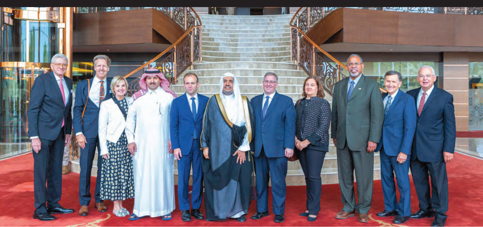
A distinguished group of evangelical leaders meet with H.E. Dr. Al-Issa in Saudi Arabia for second meeting.

As reported by Saudi News, in a joint statement, the two sides "reaffirmed their common values and pledged to strengthen cooperation" in achieving them. They also stressed the need to renounce all forms of extremism and hatred and work together "to build bridges of cooperation."